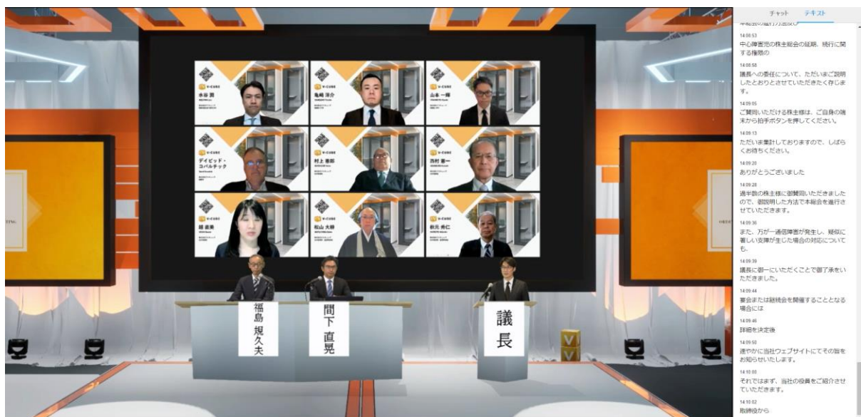
< Shareholders' meeting: automatic transcription displayed on the right side of the screen >